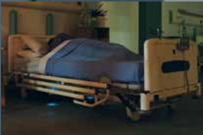
The intuitive under bed iQ night light illuminates the floor around the bed, ensuring that the patient can safely enter and exit the bed, reducing risk.