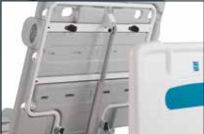
The backrest has an innovative ratchet actuator to reduce the risk of patient entrapment.