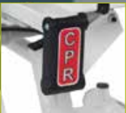
Easy access manual CPR handle with CPR mechanism. Electric CPR is located on the nurse handset.