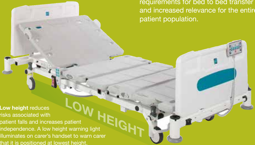
Low height reduces risks associated with patient falls and increases patient independence. A low height warning light illuminates on carer's handset to warn carer that it is positioned at lowest height.

This level of design flexibility means the bed is suitable for a wide range of patient groups, resulting in reduced requirements for bed to bed transfer and increased relevance for the entire patient population.