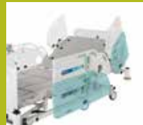
Innov8 iQ split side rails movement