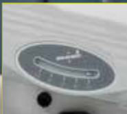
Backrest and mattress angle indicators help with specific nutritional and post-operative nursing procedures.