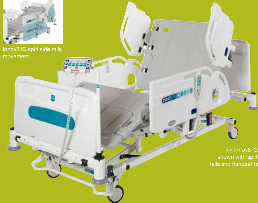
<< Innov8 iQ Bed shown with split side rails and handset holder